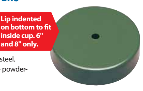
Note: Use Cup Setter to ensure proper cup depth of 1" (2.5 cm).