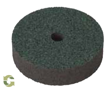
Note: Use Cup Setter to ensure proper cup depth of 1" (2.5 cm).