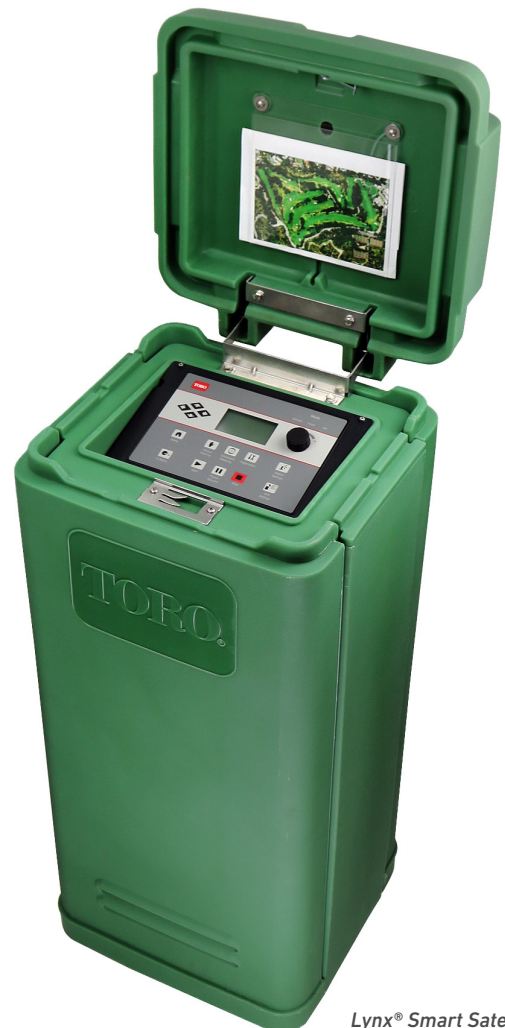
Lynx® Smart Satellite

Station-Based Flow Management, current sensing and alarm response, runtimes to the second, Group Multi-Manual operation, Basic/Advanced/Grow-In programs