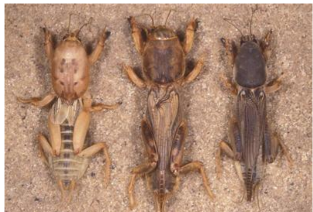
Three mole cricket species: shortwinged mole cricket, Scapteriscus abbreviatus (left); tawny mole cricket, Scapteriscus vicinus (center); southern mole cricket, Scapteriscus borellii (right).