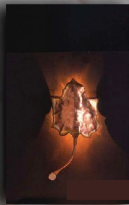
MAPLE LEAF DECK #ML5 DIM. 4.5"X3.75" LAMP: 20W G4 BI-PIN