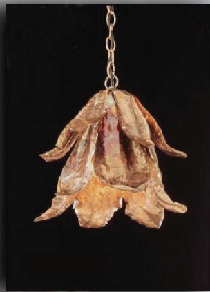
MOON FLOWER #M12 DIM. 12"X12" 3' SWAG CHAIN LAMP: 20W G4 BI-PIN