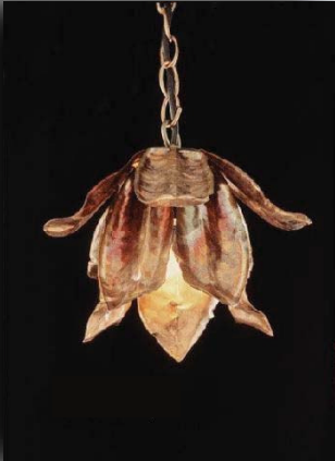
MOONDROP #MD5 DIM. 7"X8" 3' SWAG CHAIN LAMP: 20W G4 BI-PIN