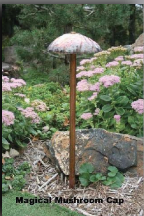
Magical Mushroom Cap