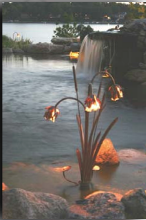
CATTAIL LIGHTED FOUNTAIN #CFL48 DIM. 48"H X 30"D LAMP: 3 X 20W G4 BI-PINS