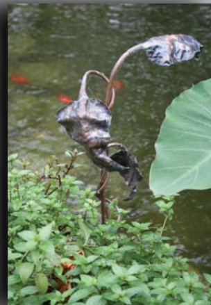
CALADIUM LITTLE LEAF #CLL24 DIM. 24"HXDIA. VARIES LAMP: 20W G4 BI-PIN