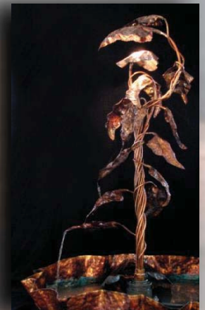
MONARCH CALADIUM FOUNTAIN #MMCF38 (SHOWN WITH OPTIONAL SHELL TRAY) DIM. 40"HX16"D LAMP: 2 X 20W G4 BI-PIN