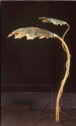
OAK PATHLIGHT PETITE #OPP24 DIM. 24"HX12"D LAMP: 20W G4 BI-PIN