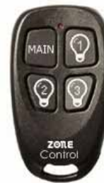
4-Button Part# ZoneCTRL-4ButtTx