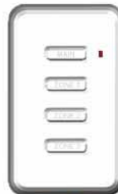
Wall Fob Part # ZoneCTRL-WallTx