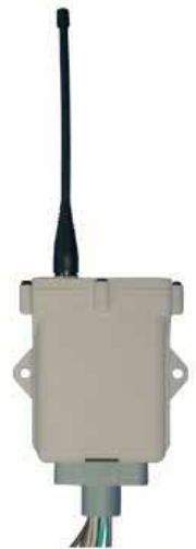
Zone Control's water resistant receiver includes 3 built in timers.