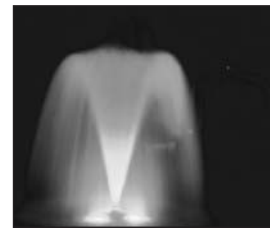
3HP Crown Gusher

Here are some pictures of Aqua Control's most popular nozzles. Aqua Control is the only manufacturer of fountains that have a deepwater intake. With a deepwater intake the pond will receive better circulation which leads to a better aerated pond. Aqua Control also manufactures a horizontal configuration which is ideal in ponds that have fluctuating pond depth. These fountains come with a 3 year warranty and a motor that does not require periodical oil changes. Please contact us for more information or prices.