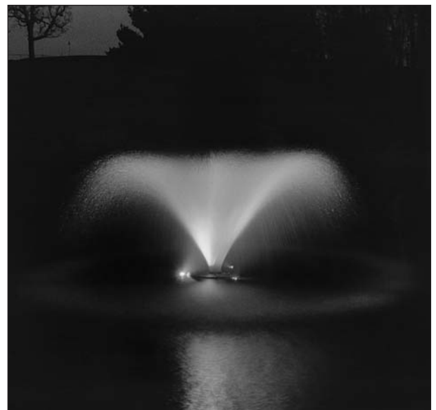
1/4 hp Kasco JF-Series